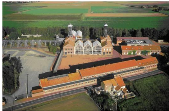
Aerial view of the Historic Mining Centre

Created in July 1982, the Centre Historique Minier is made up of three complementary structures: a mining museum, an archive and documentary resources centre, and a centre for scientific energy culture (CSEC). The site, which opened two years later in May 1984, received 17,594 visitors that year.