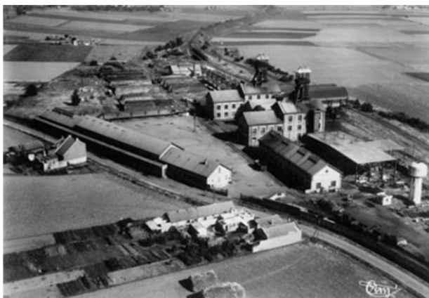
Aerial view of the Delloye pit, circa 1950-60

The Delloye pit, operated by the former Compagnie des Mines d'Aniche, began its activity in 1931. In that year, 18,634 tonnes of coal were extracted. The tonnage record was reached in 1963, with 1,218 tonnes extracted per day. Difficult to mine, the deposit became unprofitable and operations stopped in 1971.