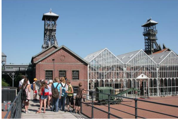
View of the site from the walkway

Located in Lewarde, 8 km east of Douai in the Nord, the Centre Historique Minier is located in the heart of the mining basin. It stands on the pithead of the former Delloye pit, which contains 8,000 m 2 of industrial buildings and superstructures on an 8-hectare site. It is classified as a Historic Monument and is one of the remarkable sites of the mining basin listed as a UNESCO World Heritage Site.