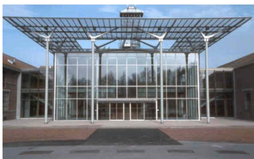
Reception building

In 1994, the Centre welcomed its millionth visitor . Activities continued to develop with the launch of a collection of books devoted to the mine under the name Mémoires de Gaillette , the first of which in 1995 was entitled Du coron à la cité, un siècle d'habitat minier dans le Nord/Pas-de-Calais, 1850 - 1950 (From miner's cottage to city, a century of mining accommodation in the Nord/Pas-de-Calais) . This marked the beginning of a publishing policy. In 1997, the QuoQuiDi patois-speaking meetings were offered for the first time, which soon became biennial.