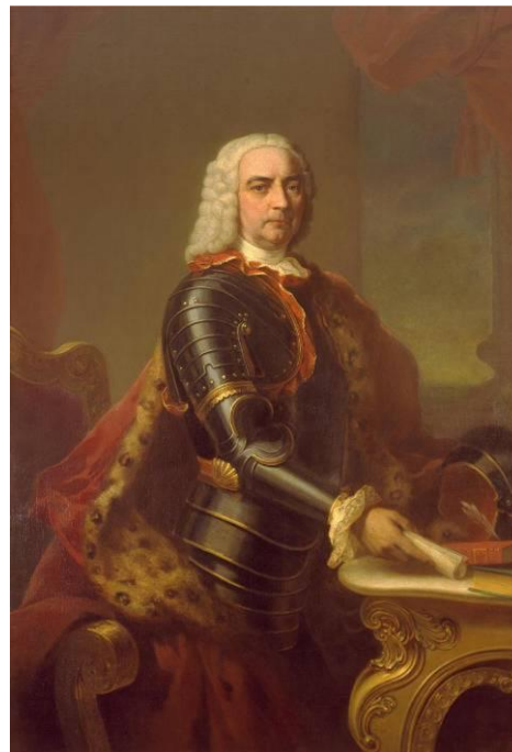
Jacques Desandrouin © Musée Théophile Jouglet, Anzin

Its movement from east to west saw increasingly deep mining activity. While the eastern pits do not go down much further than 500 m, the deepest were dug in the Lens region up to 1200 m deep.